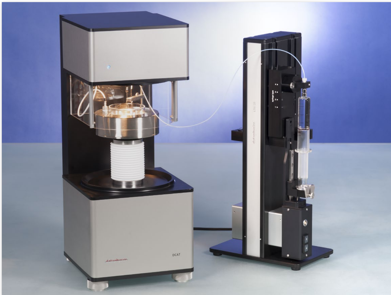
DCAT 15 with LDU 25, one ESr-LDU and one syringe holder SH-LDU