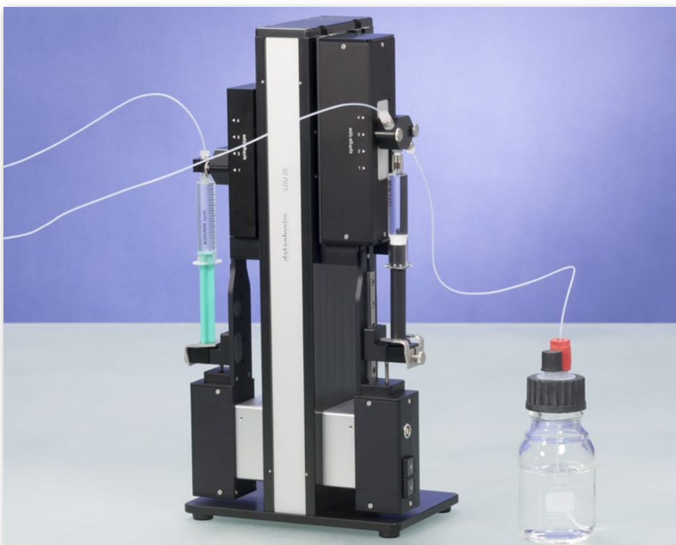
LDU 25 with two ESr-LDU, one syringe holder SH-LDU and one refill and rinse system RRS 25

The LDU 25 R2 package consists of one LDU 25, two syringe modules ESr-LDU and two refill and rinse systems RRS 25.