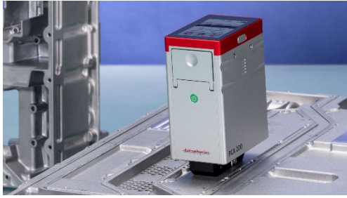
Picture 1: The Portable Contact Angle Goniometer PCA 200 is ideal for quality control during the production process. With a PCA 200, the surface energy can be measured quickly and a coating or cleaning process can be checked within seconds.